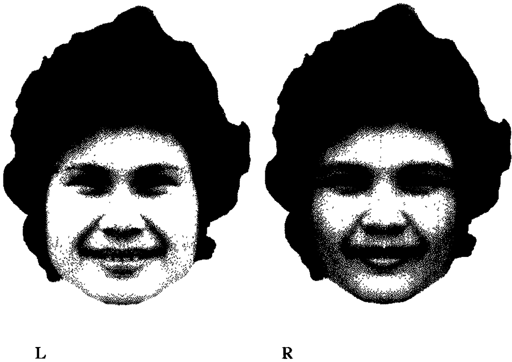
Fig. 2. Right hemifacial composite (R), vs left hemifacial composite (L). The left hemifacial composite was judged as more intensive in 70% of the observations.